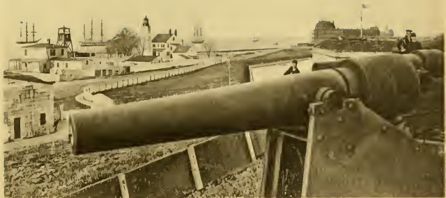
VIEW OF LIGHTHOUSE AND HARBOR, FROM RAMPARTS.